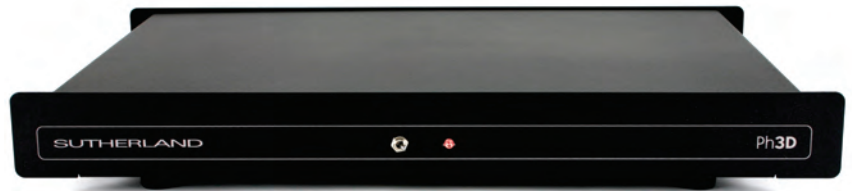
The red front panel LED indicates power on.

The red front panel LED indicates power on. As the battery voltage decreases with usage, it will get dimmer. When the voltage gets low enough that performance is compromised, the LED will go out abruptly.