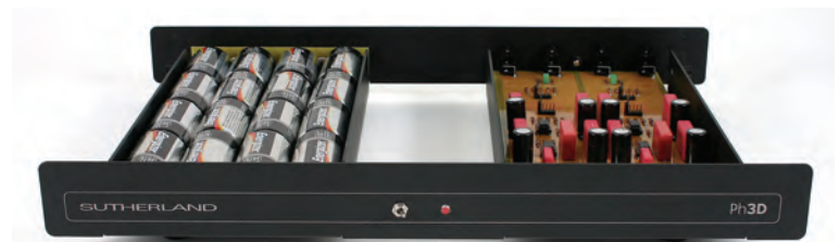
Your Ph3D is powered by 16 D-cell alkaline batteries.