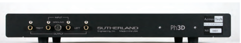
The rear panel includes inputs, outputs and a ground lug.